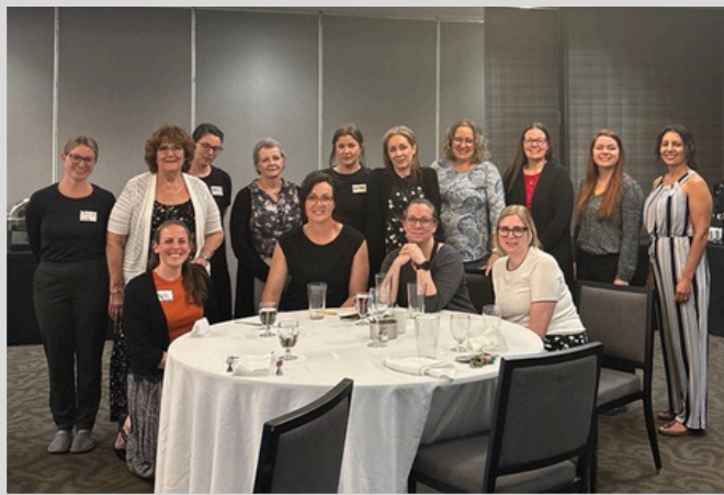
NP Event: Collaborative learning in action with Thompson Region NPs, Division Staff, Interior Health, and NNPBC