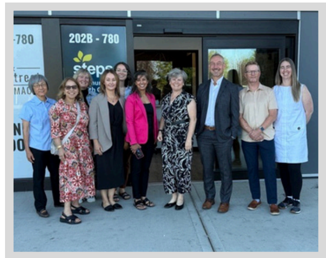
STEPS: Minister Osborne visits STEPS CHC – North Shore